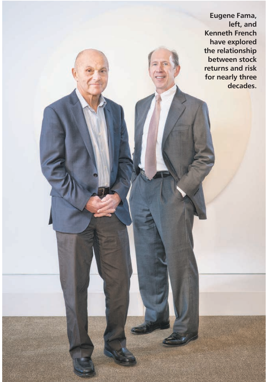
Eugene Fama, left, and Kenneth French have explored the relationship between stock returns and risk for nearly three decades.

The basics of market efficiency are often misunderstood. Some say that if factors such as a stock's value, size, trading momentum, and profitability—all of which are part of your multifactor model—indicate outperformance, then the market isn't really efficient.